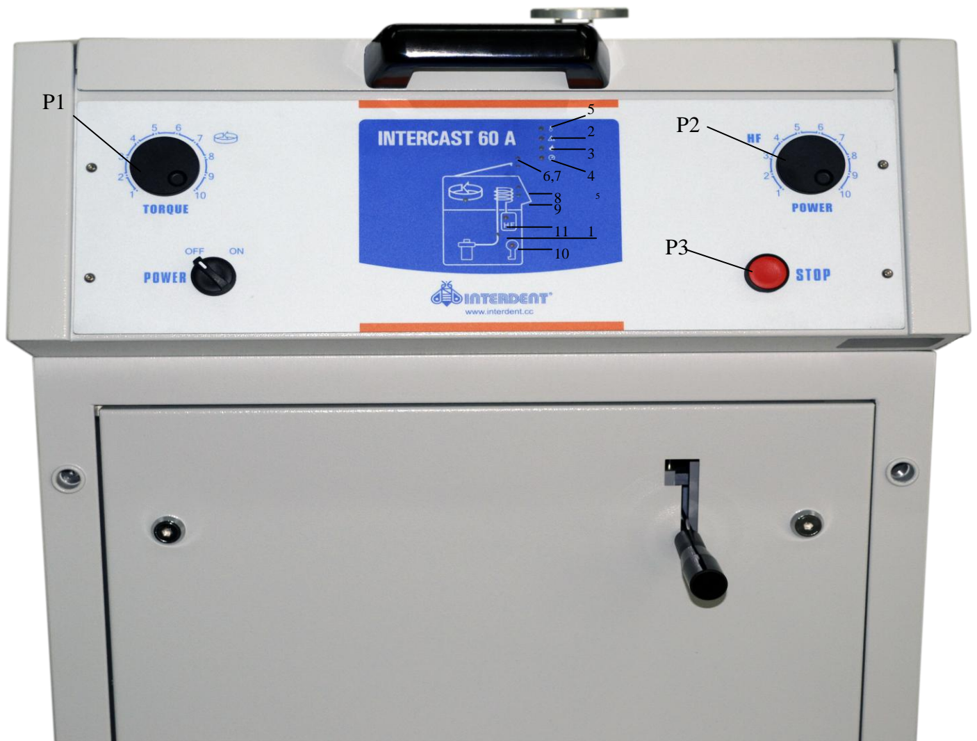
FIG. 2: CONTROL PANEL